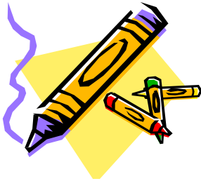
Hilroy Scrapbook 35.6 x 27.9 cm

The following is a list of supplies and items your child will need at school next year.